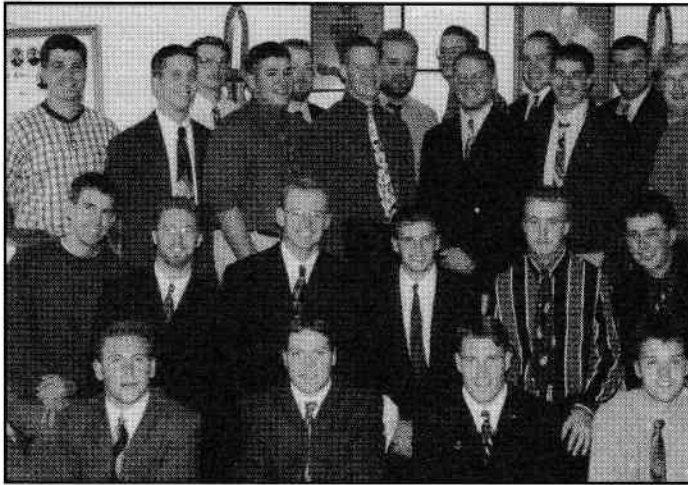
The Brothers Of Beta Gamma