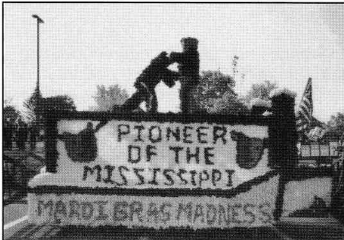
Pioneer of the Mississippi