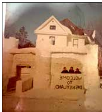
AGR House, 350 W. Pine Street, Platteville.