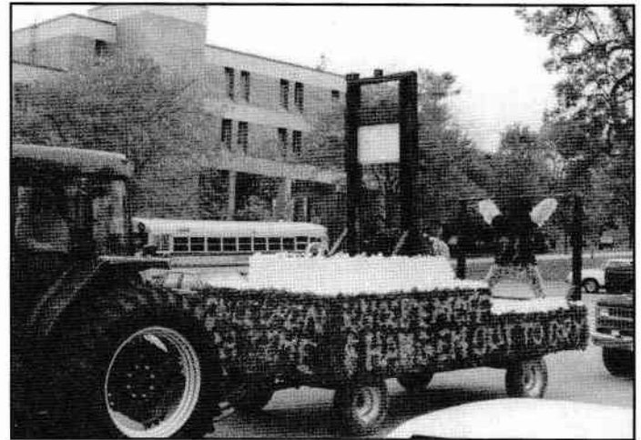
Alpha Gamma Rho Pride!