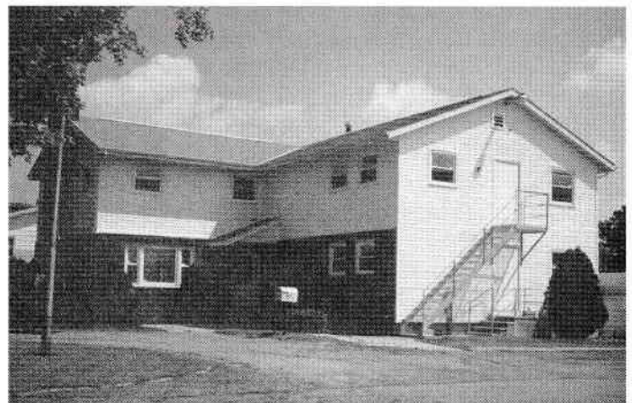
The house with new windows and siding. Thanks Alumni!!