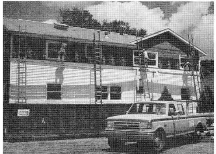
The house in the progress of getting a new face lift...

This list represents many major accomplishments which have been long overdue. It is truly a credit to your representatives on the Executive Board for pursuing these adventures in such a positive fashion. We look forward to the opportunity for continuing to work together in building an even stronger brotherhood in the year to come.