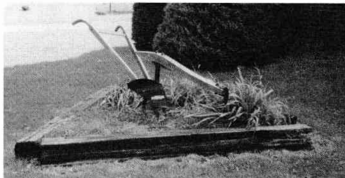
Dale Linder rebuilt the plow and it looks great!